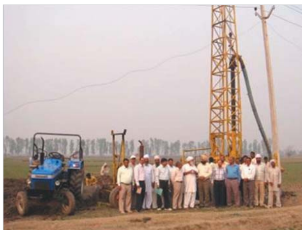
Construction of recharge shaft on farmers' field in village Jatpura

Enhancing groundwater recharge and water productivity in north-west India: The sustainability of agriculture in north-western states comprising Punjab, Haryana and Uttar Pradesh is threatened due to an alarming decline in water table, increasing pumping cost and related environmental impacts. The individual farmer-based technologies on groundwater recharge, integrated farming and laser leveling/improved irrigation have been implemented and evaluated at 90 sites in these states. The recharge structures replenished